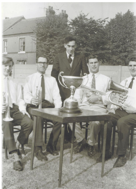
NEMBBA Quartet Champions 1970